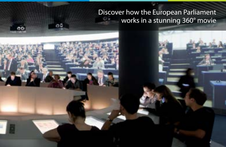
Discover how the European Parliament works in a stunning 360° movie